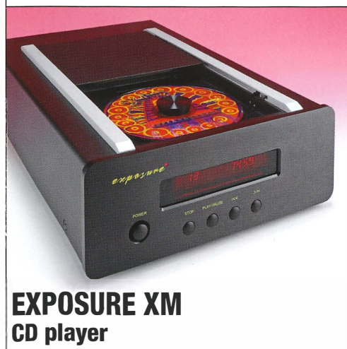
EXPOSURE XM CD player