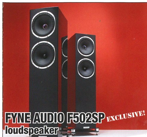
FYNE AUDIO F502SP EXCLUSIVE! loudspeaker

FREE READER CLASSIFIED ADS IN THIS ISSUE!